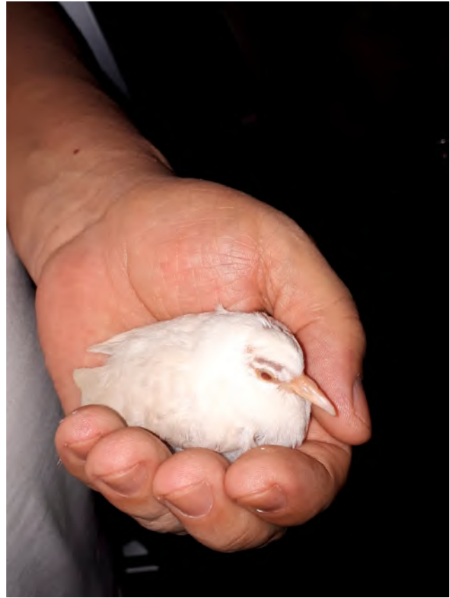
Figure 3. A young nestling Ruddy Ground-Dove ( Columbina talpacoti ) with albinism found in El Lido neighborhood in Cali, Colombia, September 8, 2020. I. C. Avila.