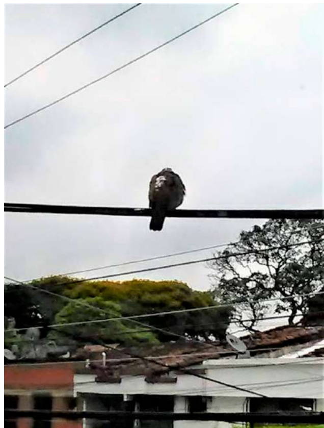
Figure 2. A female Ruddy Ground-Dove ( Columbina talpacoti ) with partial leucism, at Bosques del Limonar neighborhood in Cali, Colombia, May 25, 2020. G. Cárdenas.